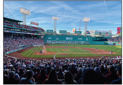
View from the Grandstand Seats at Red Sox Stadium