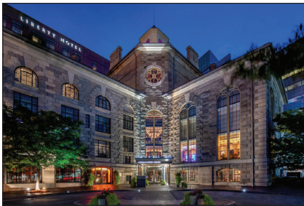
View of The Outside of The Liberty; a Luxury Collection Hotel